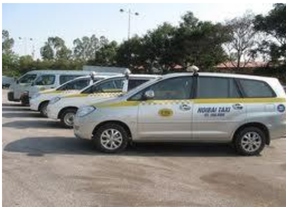
Noi Bai airport taxi

1.1 By taxi: This is the most convenient way if you have bulky luggage and it takes 45 minutes or 60 minutes depending on traffic. Taxi price: around 18 USD. (There are 6 taxi companies that can legally work at Noi Bai airport which you can see at the taxi desks near the luggage belts where you pick up your bags). They have a fixed rate of 360,000 VND (18 USD) to go to the city center.