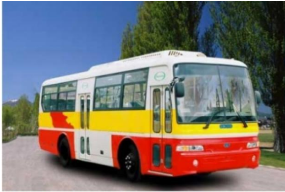
Public bus in Ha Noi

Then take the bus numbered 17 (all public buses in Hanoi are red and yellow) to the last stop (Long Bien station). It is around 15,000 VND (around 0.7 USD) (sometimes you will be charged more for your luggage)