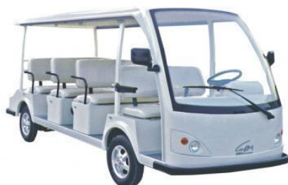
Electric bus at Noi Bai airport