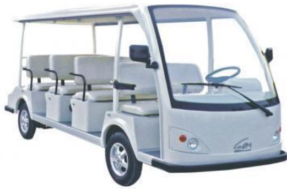
Electric bus at Noi Bai airport