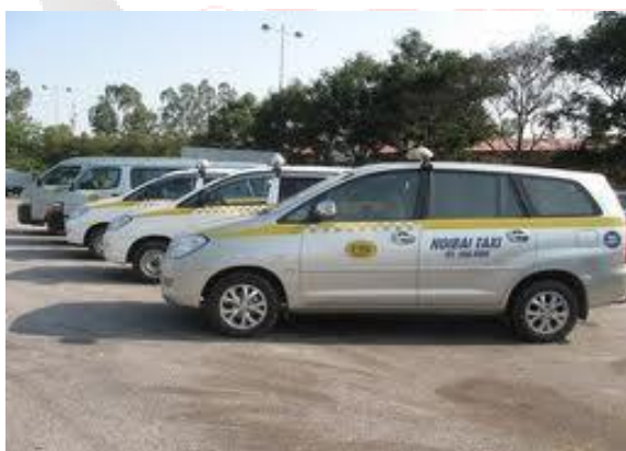
Noi Bai airport taxi

1.1 By taxi: This is the most convenient way if you have bulky luggage and it takes 45 minutes or 60 minutes depending on traffic. Taxi price: around 17 USD. (There are 6 taxi companies that can legally work at Noi Bai airport which you can see at the taxi desks near the luggage belts where you pick up your bags). They have a fixed rate of 350,000 VND (17 USD) to go to the city center.