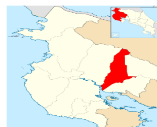
Centre of Cañas

El Hogar de Ancianos de Cañas works with around 40 elderly people mainly locals from the town. They supply different services as: