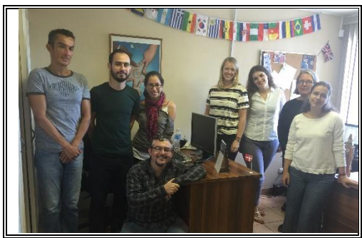
The Staff of ACI.