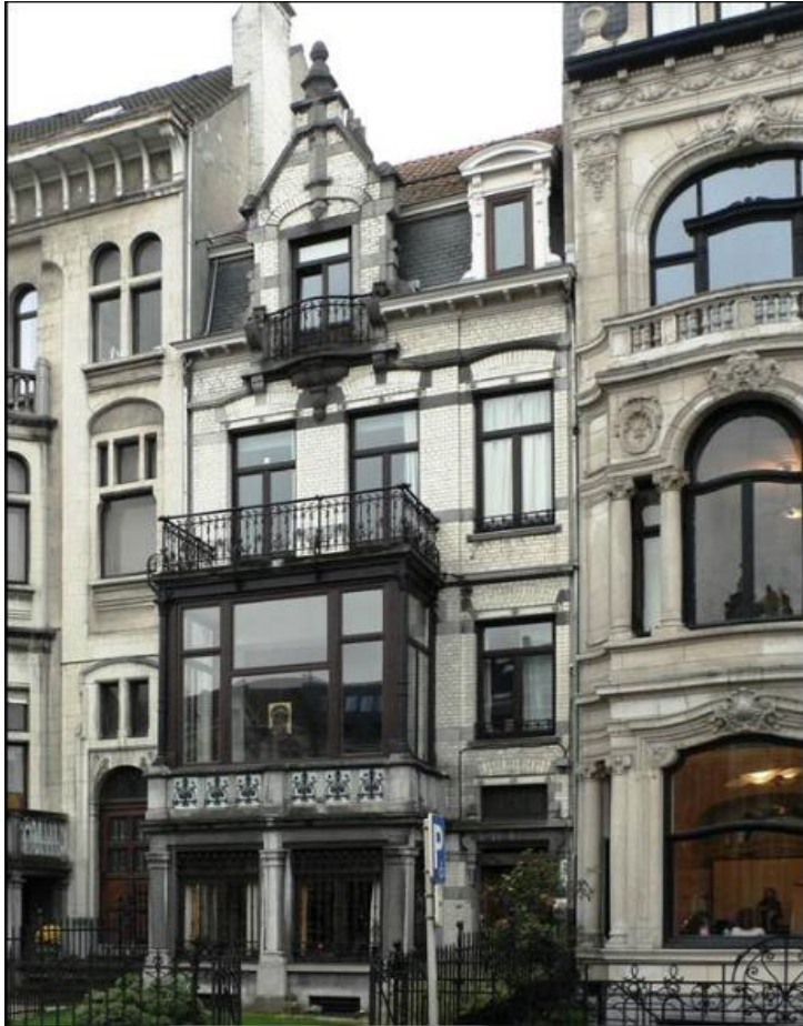
« le Toit », an example of a house

L'Arche is a non-profit organization supported by the government, including a day activity-care center and four houses inserted in the neighborhood. They propose a convivial and friendly lifestyle.